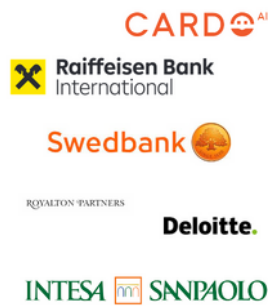
Banks & Fintechs